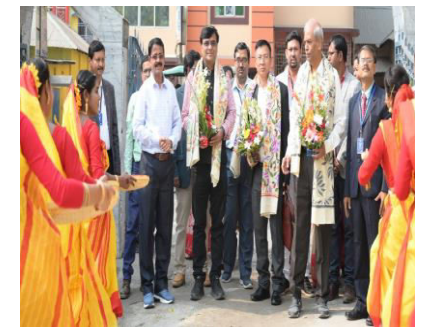
PEER TEAM VISIT