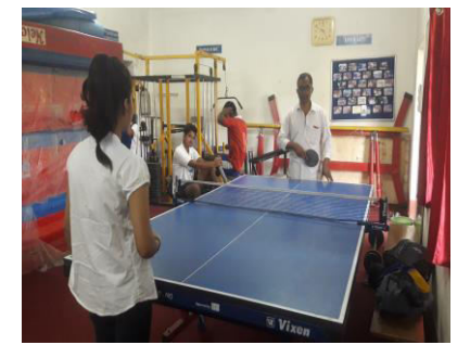
PHYSICAL EDUCATION DEPT.